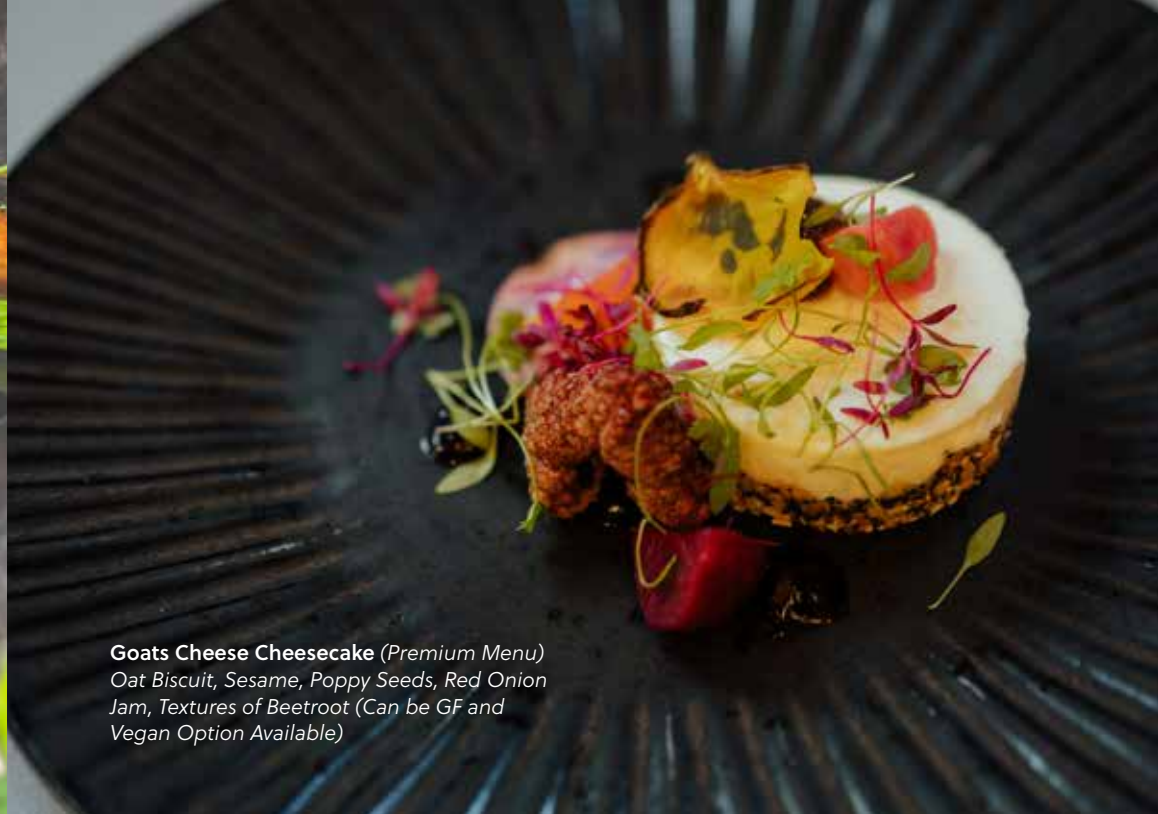
Goats Cheese Cheesecake (Premium Menu) Oat Biscuit, Sesame, Poppy Seeds, Red Onion Jam, Textures of Beetroot (Can be GF and Vegan Option Available)