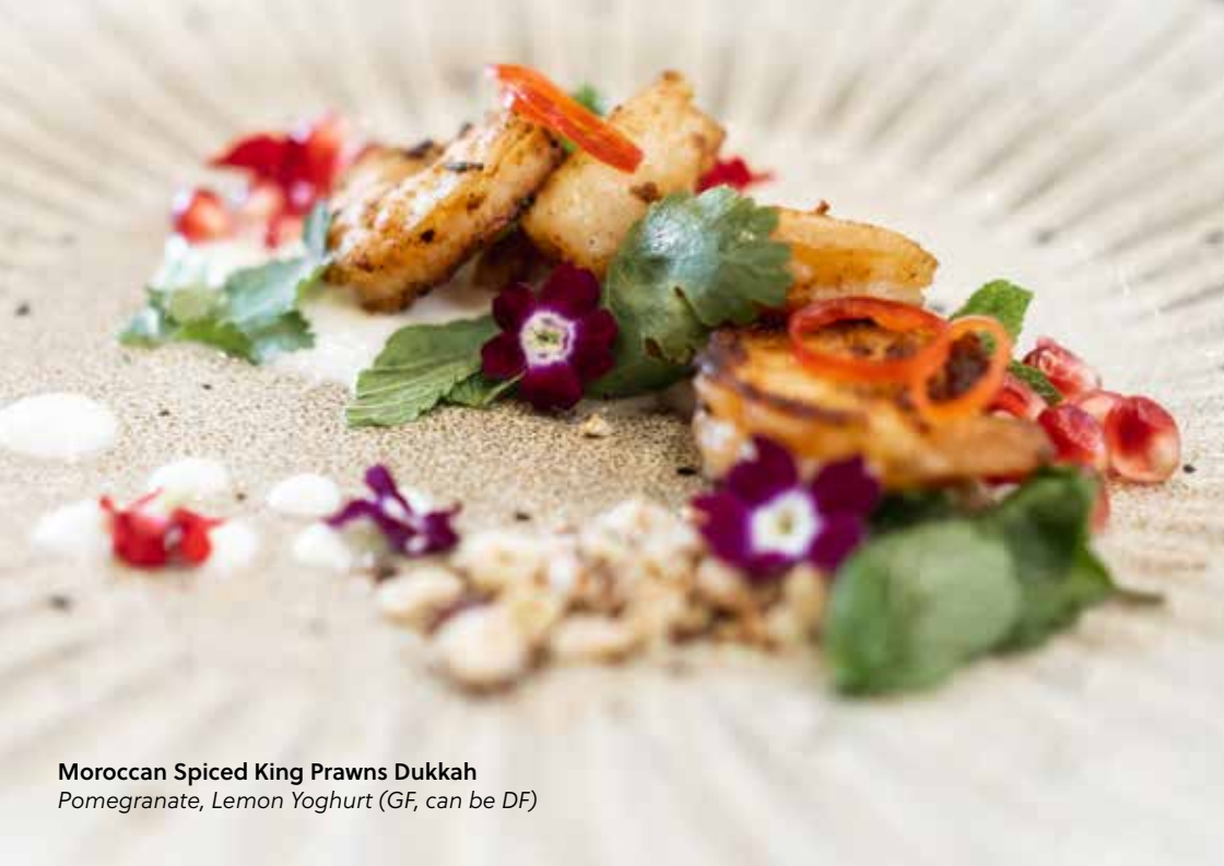
Moroccan Spiced King Prawns Dukkah Pomegranate, Lemon Yoghurt (GF, can be DF)