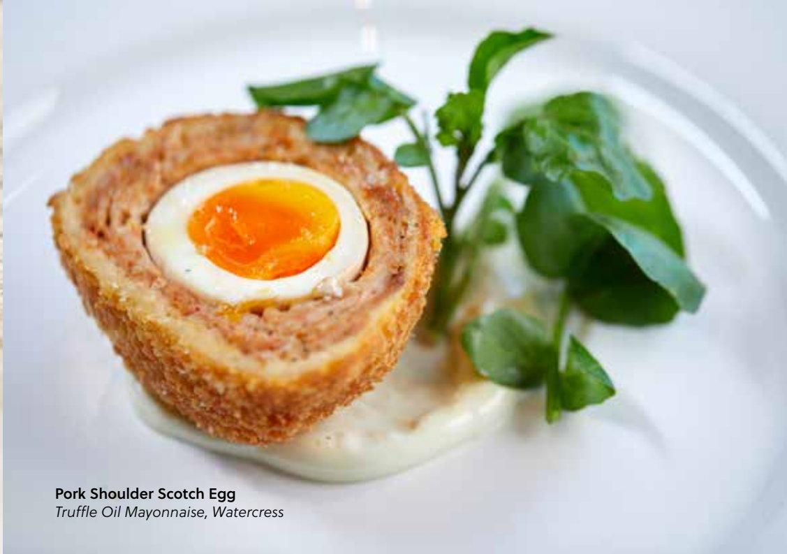
Pork Shoulder Scotch Egg Truffle Oil Mayonnaise, Watercress