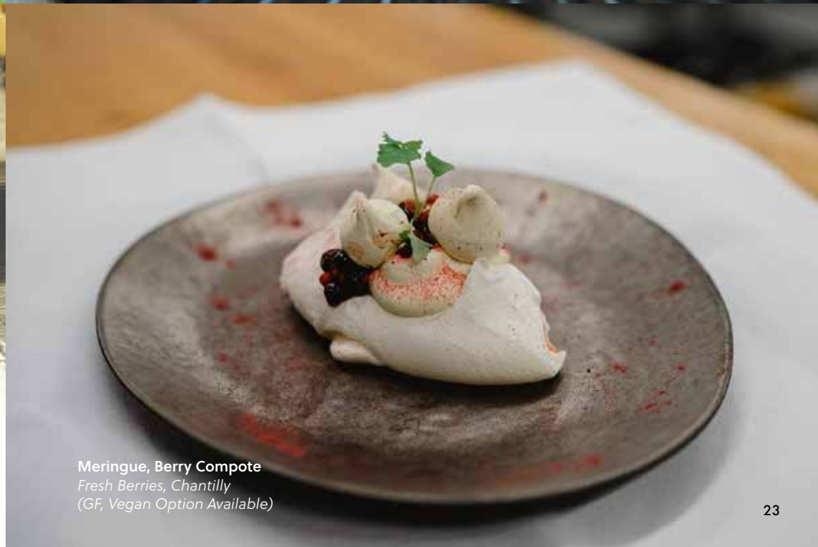
Meringue, Berry Compote Fresh Berries, Chantilly (GF, Vegan Option Available)