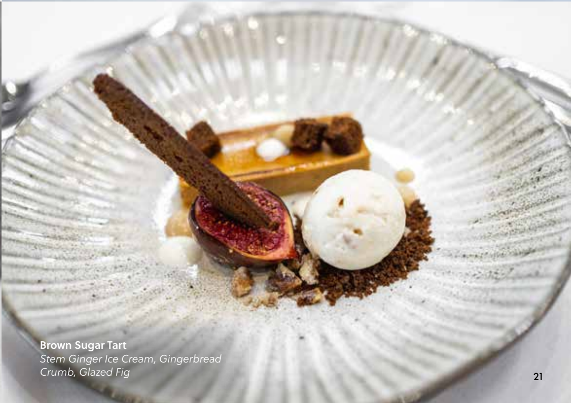
Brown Sugar Tart Stem Ginger Ice Cream, Gingerbread Crumb, Glazed Fig