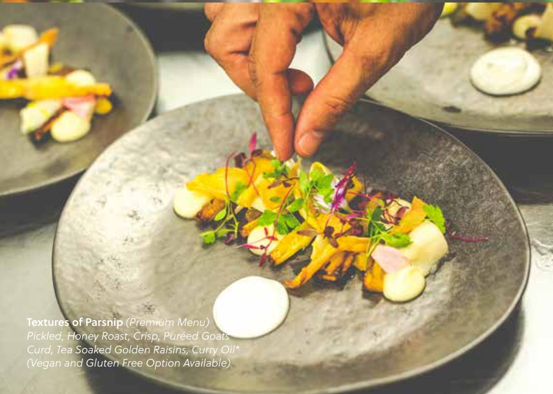
Textures of Parsnip (Premium Menu) Pickled, Honey Roast, Crisp, Puréed Goats Curd, Tea Soaked Golden Raisins, Curry Oil* (Vegan and Gluten Free Option Available)