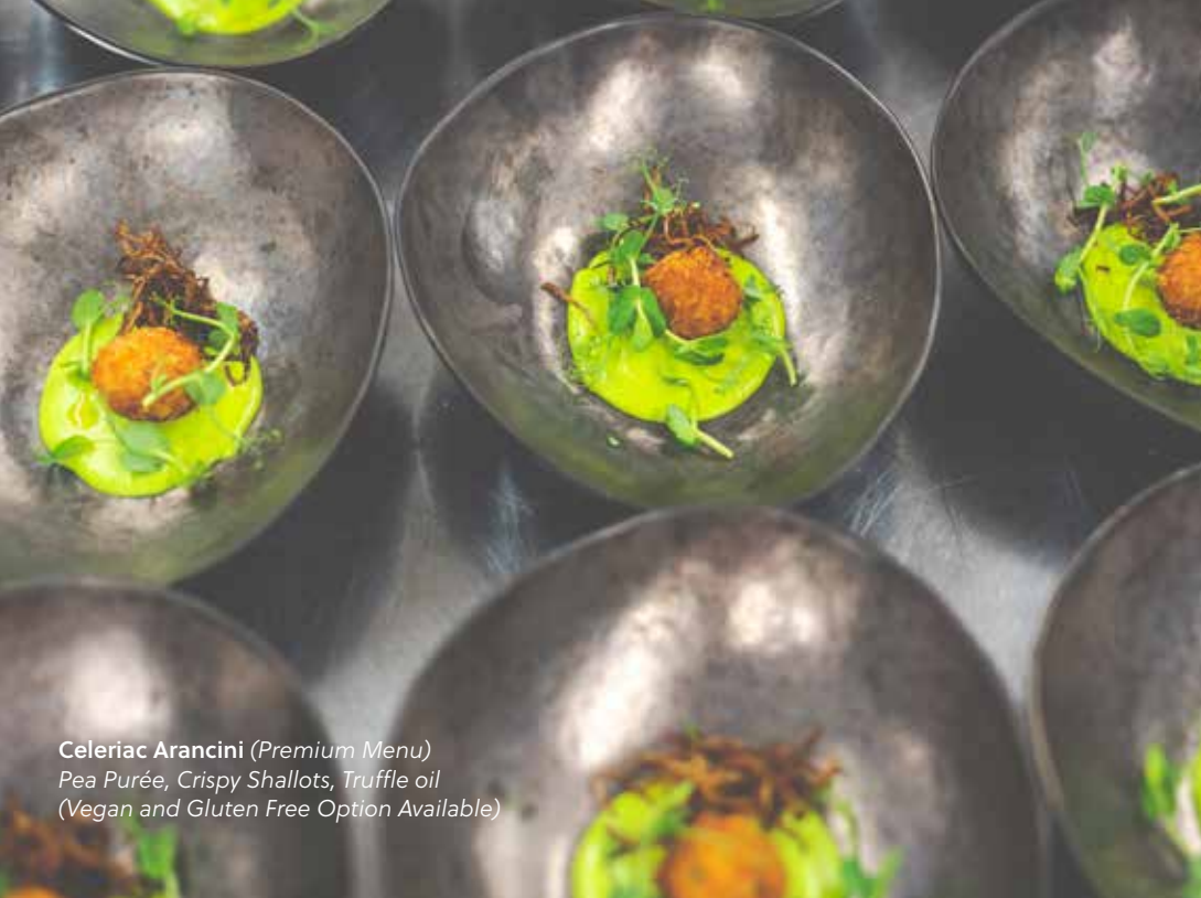
Celeriac Arancini (Premium Menu) Pea Purée, Crispy Shallots, Truffle oil (Vegan and Gluten Free Option Available)