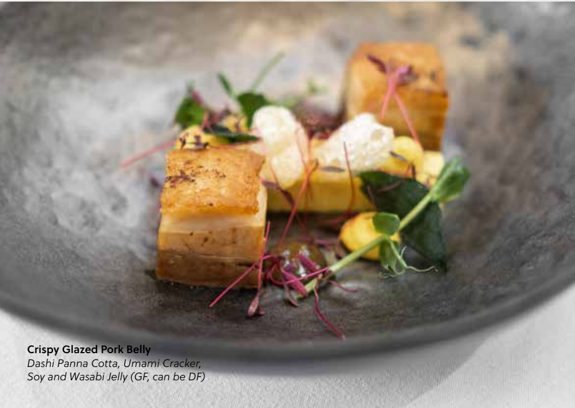
Crispy Glazed Pork Belly Dashi Panna Cotta, Umami Cracker, Soy and Wasabi Jelly (GF, can be DF)